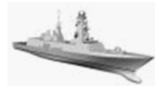
Multipurpose Frigate from Fincantieri

Design and Construction Considerations: The Bergamini class frigates will be approximately 139 meters in length (456 ft), and have a width of 19 meters (62.3 ft). Displacing approximately 5,900 tons, the frigates will be capable of attaining 27 knots. To reduce cost and risk, Fincantieri will probably incorporate significant aspects of other combatant construction programs, including the Horizon class destroyers, and the Cigala Fulgosi (P-1500) class offshore patrol vessels (OPVs – the New Minor Combatants/Nuova Unità Minore Combattentes [NUMCs]).