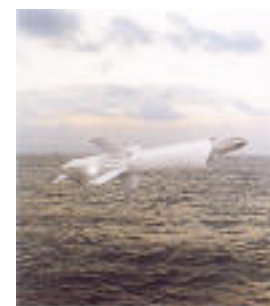
Teseo Mk3 Ulysses