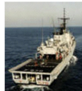
Maestrale Class Frigate