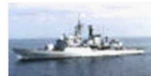
Lupo Class Frigate