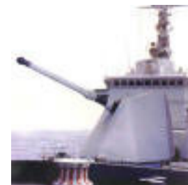
OTO Melara 127mm LWT